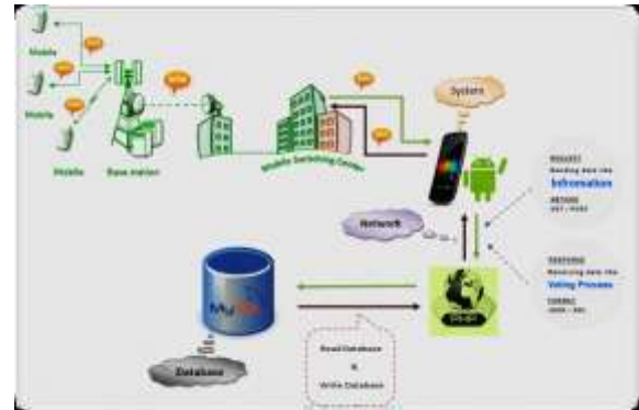
Fig. 1: SMS E-Voting System.

Each voter will vote by causing an SMS victimization any quite mobile connection line or any quite mobile hand set to the system through the "Mobile Switch Center". For this such sort system, an automaton application is formed in automaton phone, then the system can begin implementing some processes on it SMS that is shipped by the voters into the server through a network. Info is put in on the server aspect to send a result back to the voter by the automaton system application. The voter will use web connection through an internet site that is developed throughout this work. Backend is formed for the 2 ways that connection. each android system and therefore the web site area unit connected to an equivalent (MySQL) info so as to the voter will vote through one in every of the two ways that just one time and if he/she tries to vote once more the system can deny him/her.