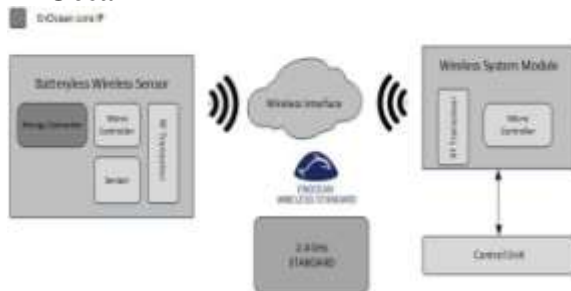
Fig. 2 EnOcean architecture

EnOcean- consistent gadgets utilize vitality converters which harvest control from surroundings by saddling temperature contrasts, light vitality, and mechanical movement. It conveys high information rate at low vitality utilization with no utilization of batteries. It deals with various all the while transmitting gadgets; these gadgets, each assuming a particular part, in homes and workplaces could be keep running for quite a long time without agonizing over battery power and support. More than around 50 fabricating organizations have as of now made around 200 EnOcean consistent items.