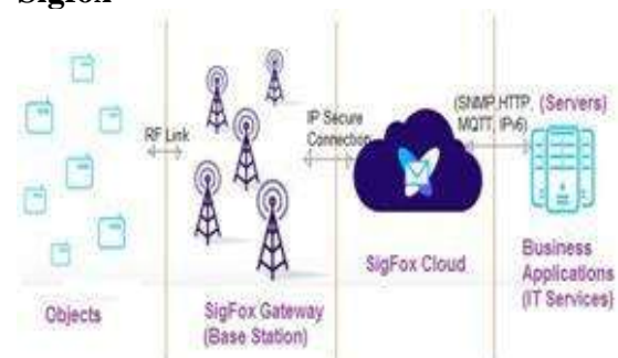
Fig. 1 Sigfox architecture