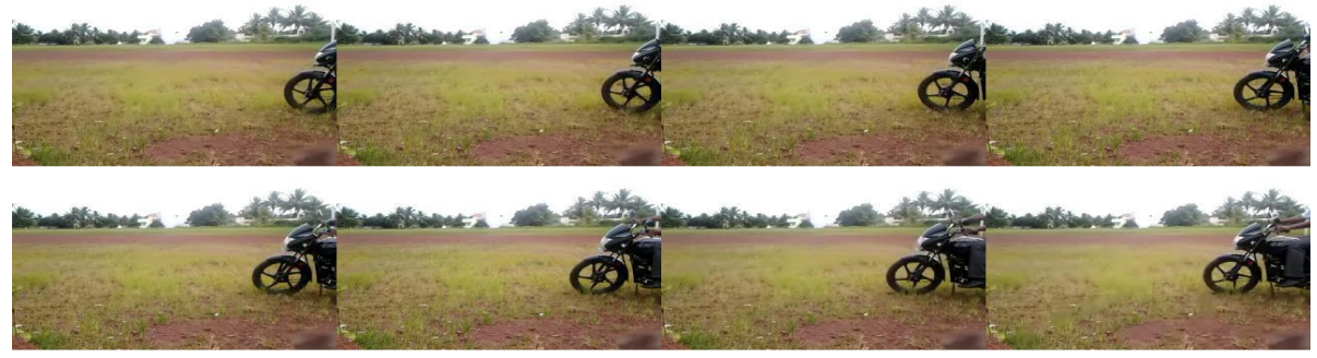
Fig4.2 indicates the some off the sequence of frames from video outdoor2.