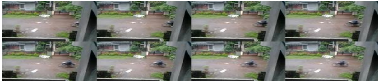
Fig4.3 indicates the some off the sequence of frames from video outdoor3