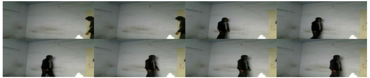
Fig4.4 indicates the some off the sequence of frames from video indoor.

As shown in the Figure 4.1 indicates the some off the sequence of frames from video outdoor1. Figure 4.2 indicates the some off the sequence of frames from video outdoor2. Figure 4.3 indicates the