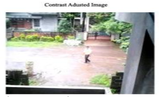
Fig4.5 indicates the with & without contrast adjustment

In auto contrast process we adjust each frame with some upper and threshold values to enhance the edges of the images.