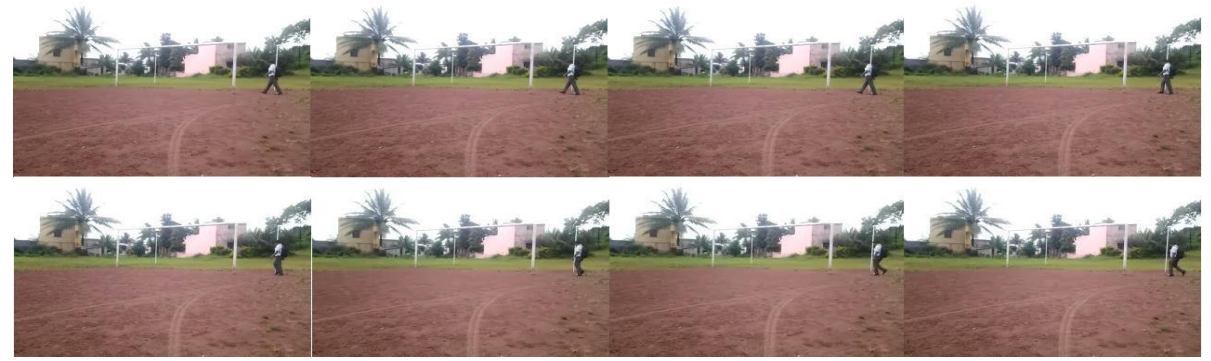
Fig4.1 indicates the some off the sequence of frames from video outdoor1

As in this case we have applied the entropy calculation and then discarding the segment by applying a suitable threshold we get various compression ratios for each video.