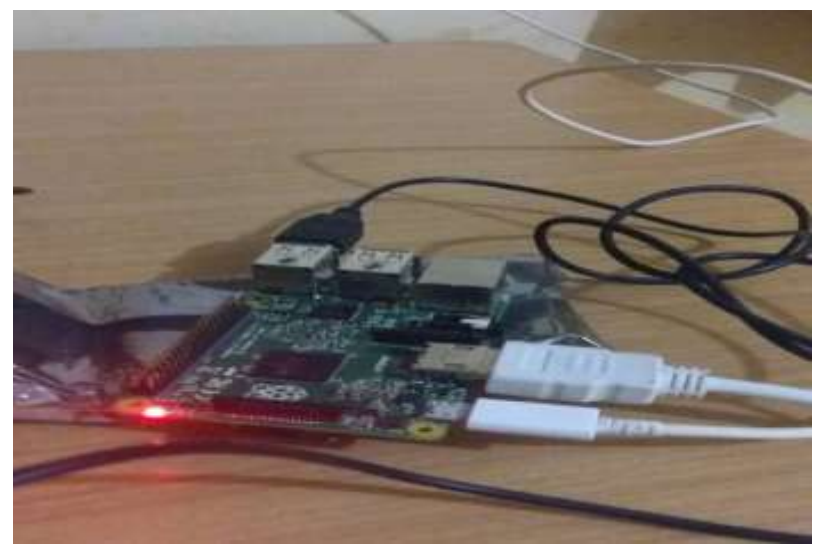
Fig.3 Bluetooth signal retrieves the corresponding activity from database