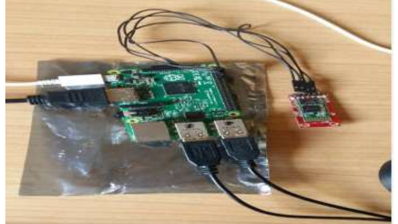
Fig.2 Bluetooth module acting as interface between Raspberry Pi & mobile

The experimental setup of the proposed system is depicted in the below snapshots: